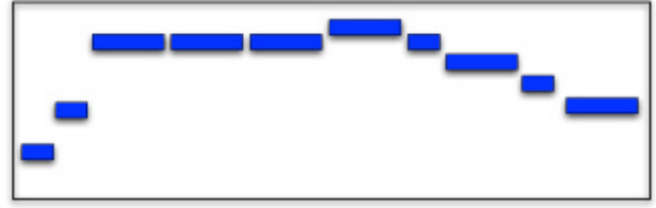
O Pião Entrou B Section