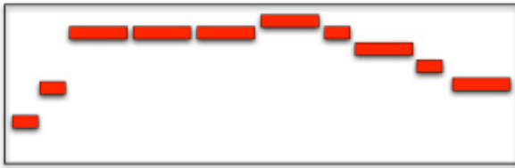
O Pião Entrou A Section